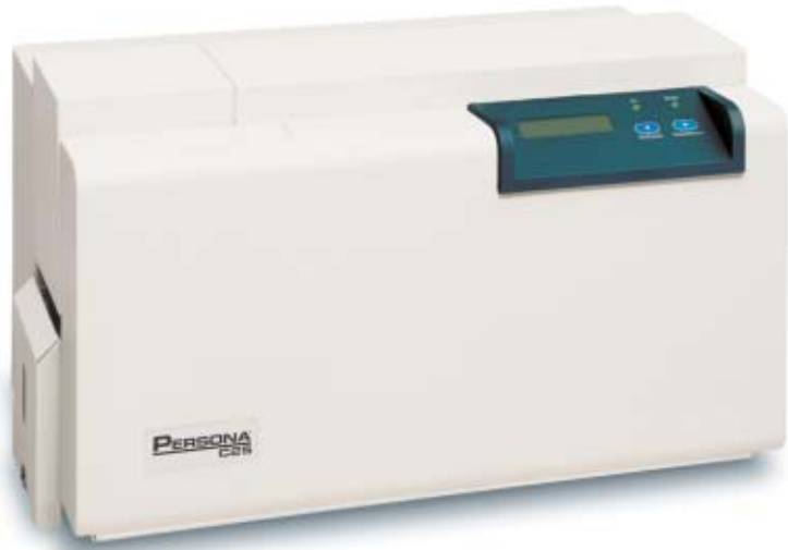
The Persona C25 Desktop Card Printer